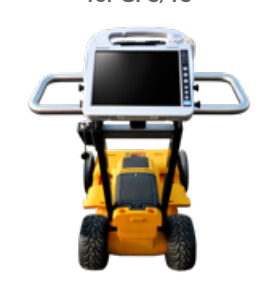
Large handle for enhanced maneuverability