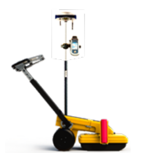
Equipped with dedicated kit for GPS/TS

Gives you the perfect grip and makes easier the transportation