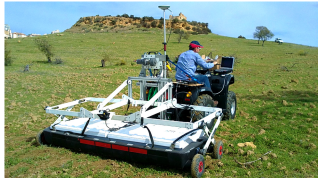
Stream X survey